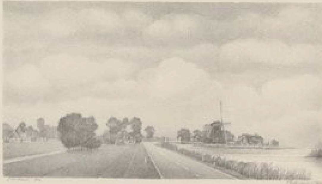
Oterleek, North Holland